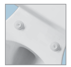
EASY REMOVAL OF SEAT FOR THOROUGH CLEANING