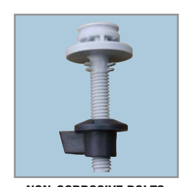
NON-CORROSIVE BOLTS AND WING NUTS