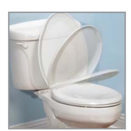
WHISPER • CLOSE® FEATURE